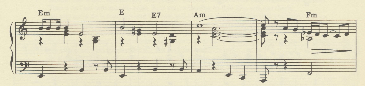
Copyright © 1963 by Blue Seas Music, Inc., Jac Music Co., Inc., New York, N.Y. Blue Seas Music Ltd., Jac Music Co. Ltd., 24 Parkside, Knightsbridge, London, S.W.1, England This arrangement Copyright © 1970 by Blue Seas Music, Inc., Jac Music Co., Inc. International Copyright Secured Copyright Secured Line Seas Music Co., Inc., Jac Music Co., Inc. Made in U.S.A. Line Seas Music Co., Inc., Made Description of All Rights Reserved